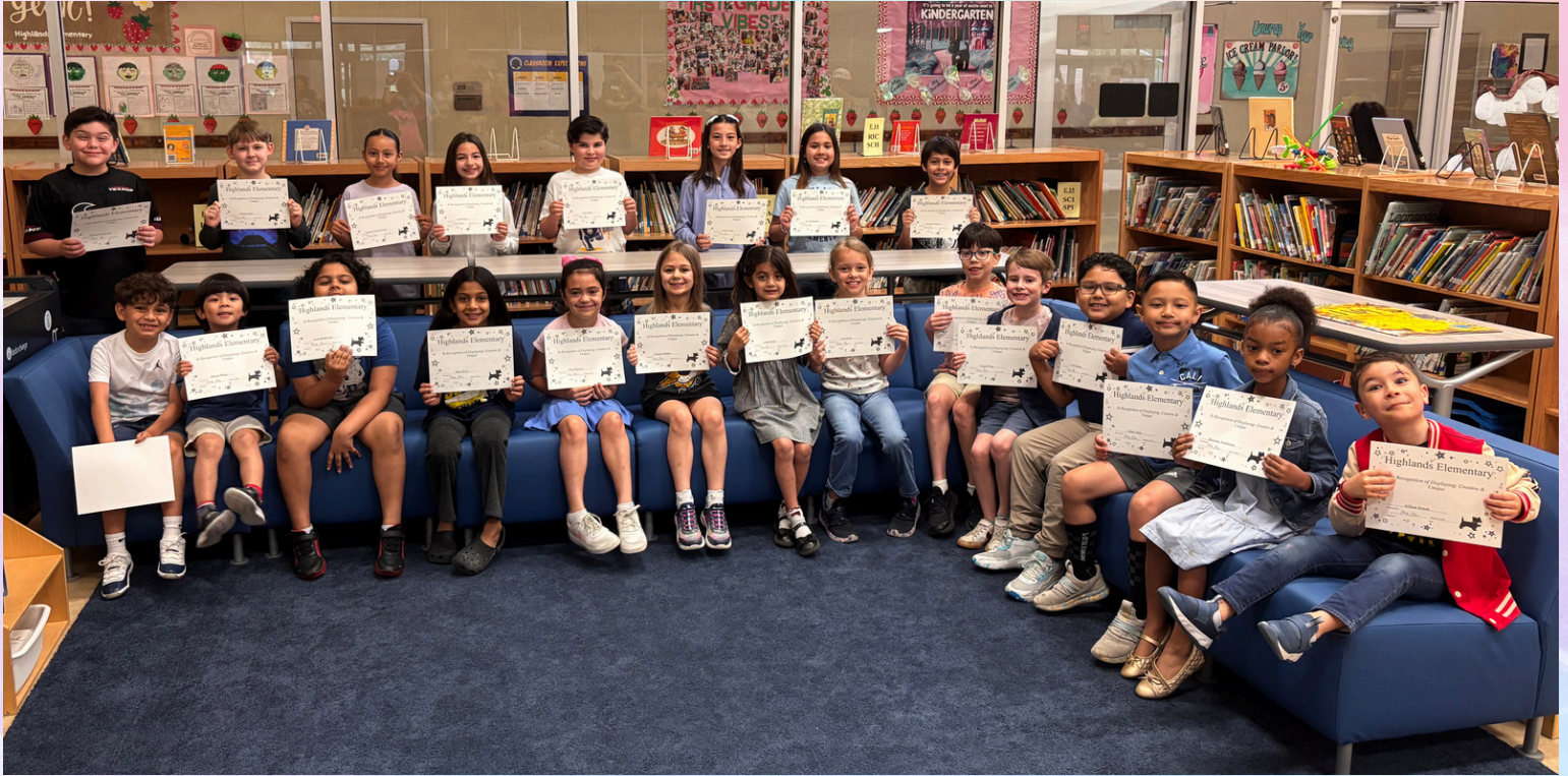
"Student of the Month" and spirit stick winners